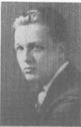
Stanley G. Weinbaum