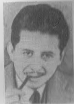
Frank Belknap Long, Jr.